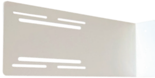
MONITOR MOUNT MB1