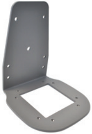
CHARGING STATION WALL MOUNT WMB1