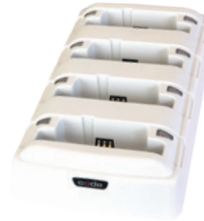
CHARGING STATION A160